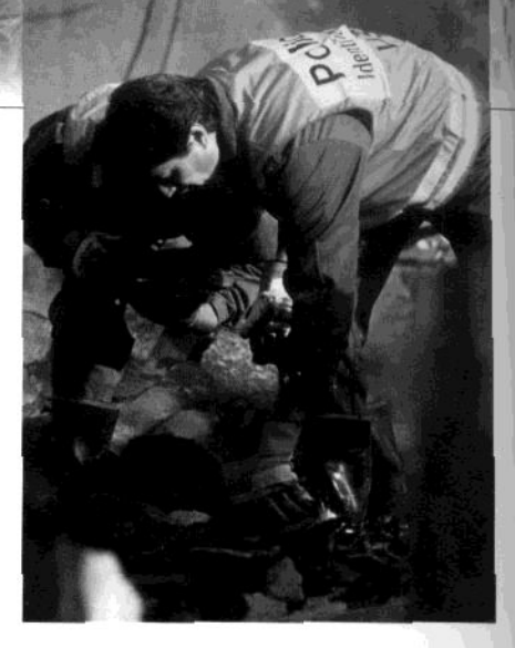
CULT FIRE A

Called hydrocarbon vapor detectors, they draw in air and feed the samples to a hydrogen flame. A hotter flame indicates the presence of an accelerant.